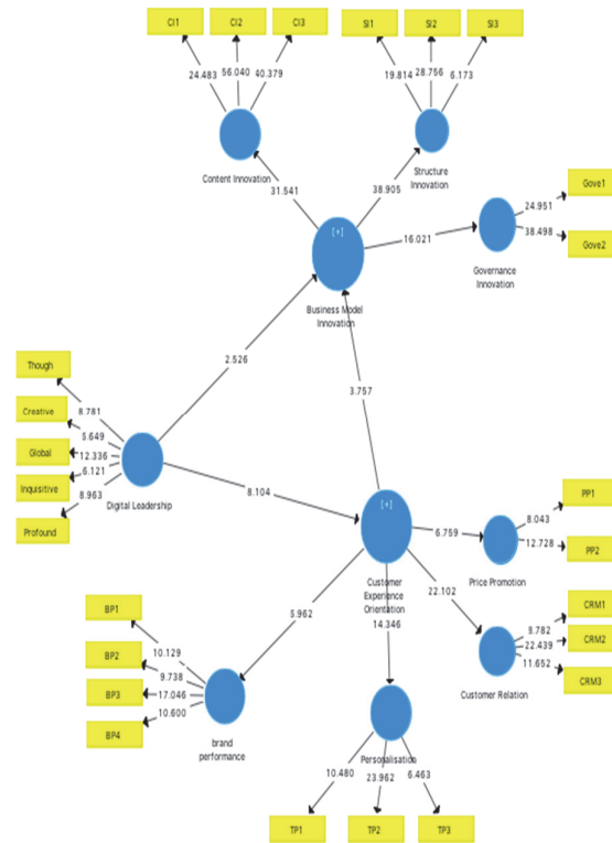
Fig. 2. Complete of Research Model Result

The indirect effect test shows that the mediating role of customer experience orientation had a path coefficient score=0,340 with t-statistics = 3.038 and p-value = 0.002. This means that H_0 was rejected and H_1 was accepted. This proves that customer experience orientation had supportive impact as mediating role on relationship between business model innovation and digital leadership.