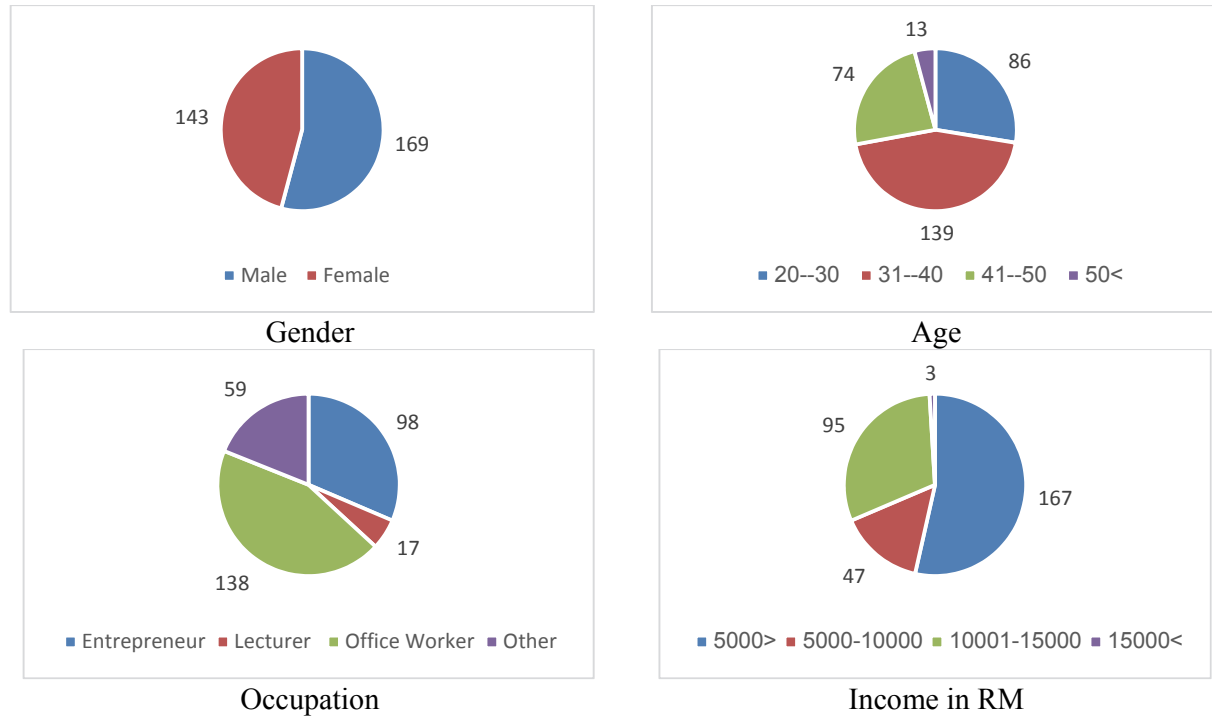
Fig. 2. Personal characteristics of the participants

The profile of the respondents consists of gender, age, occupation and income. There are 312 respondents as the sample of this research, the respondents are people who made some real state purchase and/or plan to buy a residential property in Selangor Malaysia. The results are summarized in Fig. 2. According to the figure, more than half of the participants were male. In terms of age, about 96% of the participants were less than 50 years. In addition, the survey indicates that more than half of the participants earned less than 5000RM. Table 1 presents the results of coefficient determinant test.