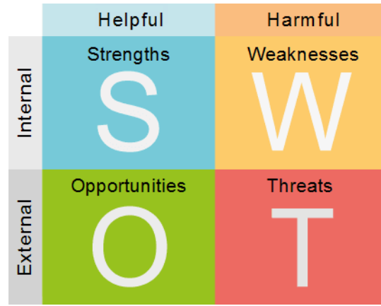
Fig. 2. The structure of SWOT

The analysis consists of two major items of external and internal factors. Table 1 demonstrates the summary of opportunities and threats associated with external factors.