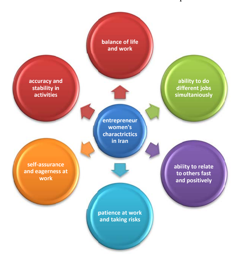
Fig. 1. Research conceptual model

In addition, the following conceptual model shows six superior characteristics of entrepreneur women that can be considered for other women who would like to be entrepreneur.