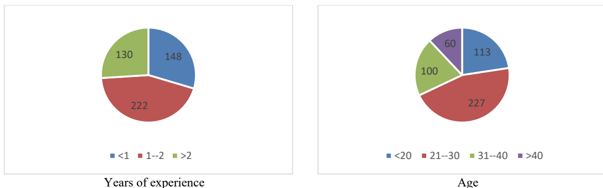
Fig. 2 shows personal characteristics of the participants.