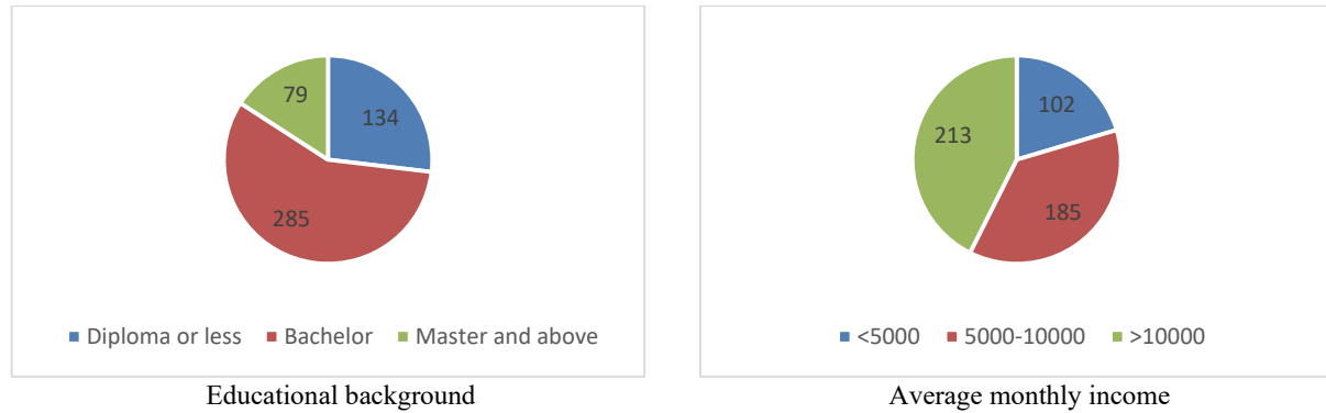
Fig. 2. Personal characteristics of the participants

In our survey, 75% of the participants were male and the remaining 25% were female. Table 1 demonstrates the summary of the descriptive statistics.