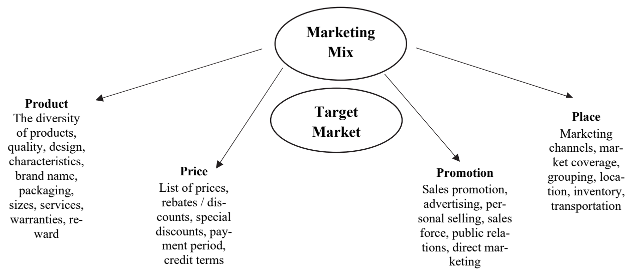
Fig. 1. Four P components in the marketing mix (Kotler and Keller 2009)

The marketing mix is a collection of tactical marketing tools basically consisting of product, price, place, and promotion of the combined company to produce the response it wants in the target market (Kotler & Armstrong 2008). The marketing mix is also defined as a set of marketing tools a company uses mainly to pursue marketing objectives (Kotler & Keller 2009). The marketing mix for tangible products is usually referred to as the 4P's strategy. The marketing mix for intangible products (services) includes the marketing mix component for tangible products (product, price, place, and promotion) plus the components of people, physical environment, and process (Lovelock et al. 2010). This is then called the 7P's strategy. This strategy has further been developed into 8P's, with the addition of Productivity & Quality. The marketing mix of tangible products is presented in Fig. 1.