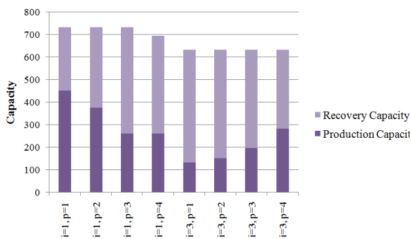
Fig. 2. Allocated production and recovery capacity in time periods