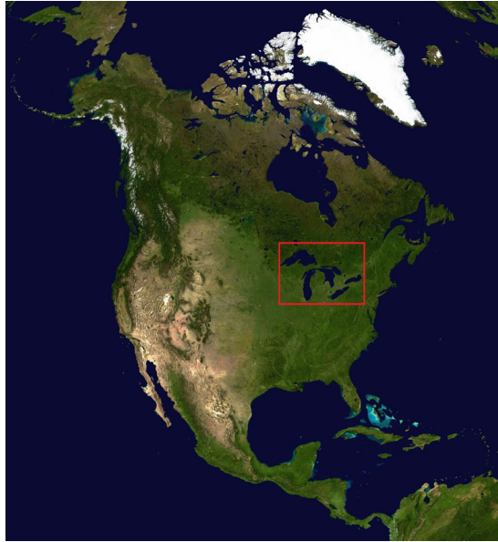
Fig. 1. The Great Lakes