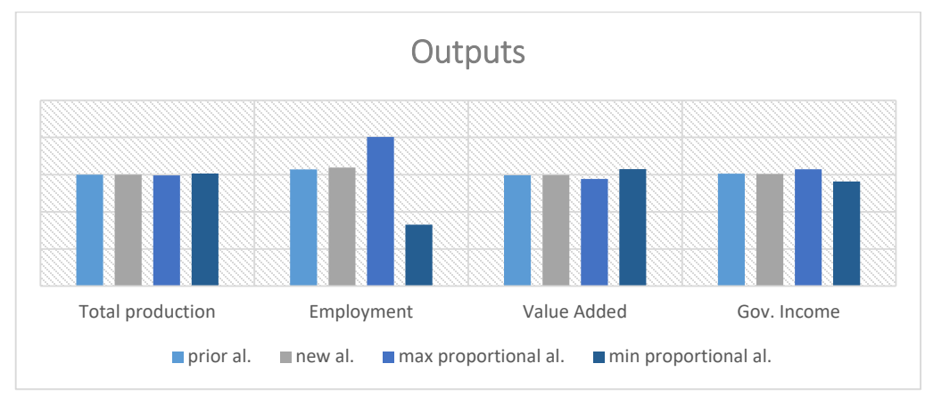
Fig. 3. The normalized amount of output indicators for the whole society

Like input indicators, results can be interpreted for output indicators in Fig. 3. The most impressive output indicator is employment, which leads to 1129952 people employed by our new method, 1127033 people employed by prior fair allocation, 1175940 people employed in maximum proportional allocation, and 1043772 people employed in minimum proportional allocation methods. For instance, although the amount of added value in the new method is slightly more than prior one, extra economic growth, owing to investment injection, is 3.71 percent for both approaches. According to Fig. 2 and Fig. 3, prior fair allocation and our new method are more reliable than the two maximum and minimum proportional allocations, which cause dramatic increase or decrease in some indicators such as imports and employment respectively.