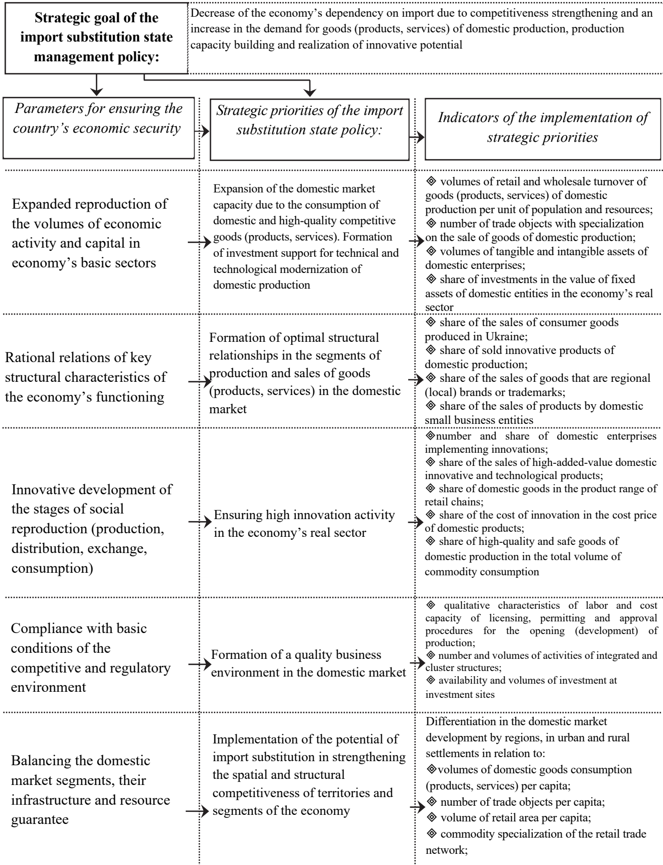
Fig. 3. Characteristics of the strategy of the implementation of import substitution management policy and ensuring the country’s economic security